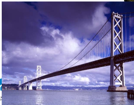
U.S. Federal Highway Administration

FTA Transit Target Setting Course (under development)