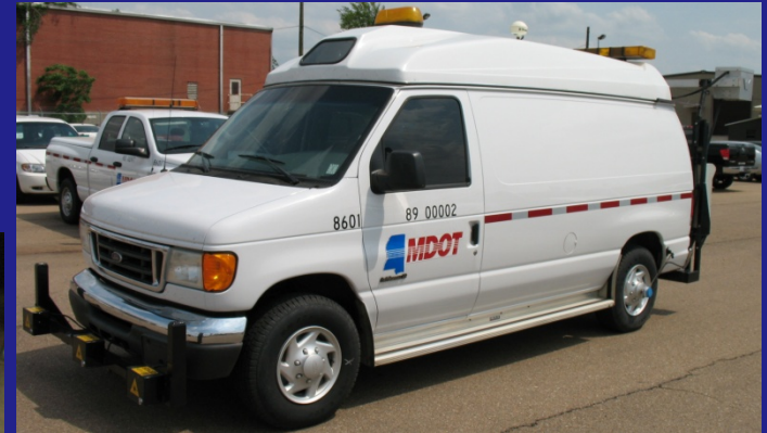
Pathway High Speed Profiler