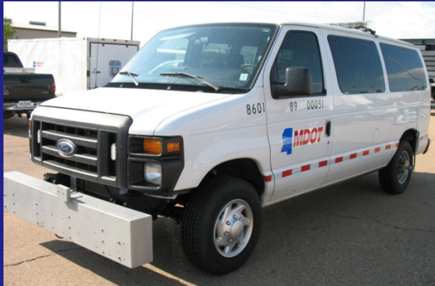
ICC High Speed Profiler